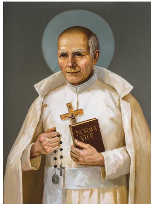
Saint Stanislaus Papczyński