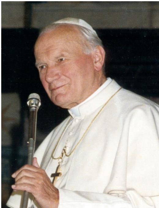
Saint Pope John Paul II